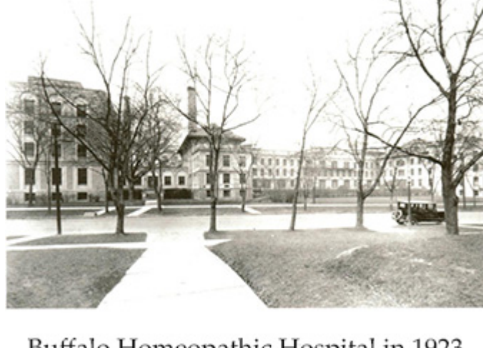
Buffalo Homeopathic Hospital in 1923

arsenal of remedies as effective today as they were then.