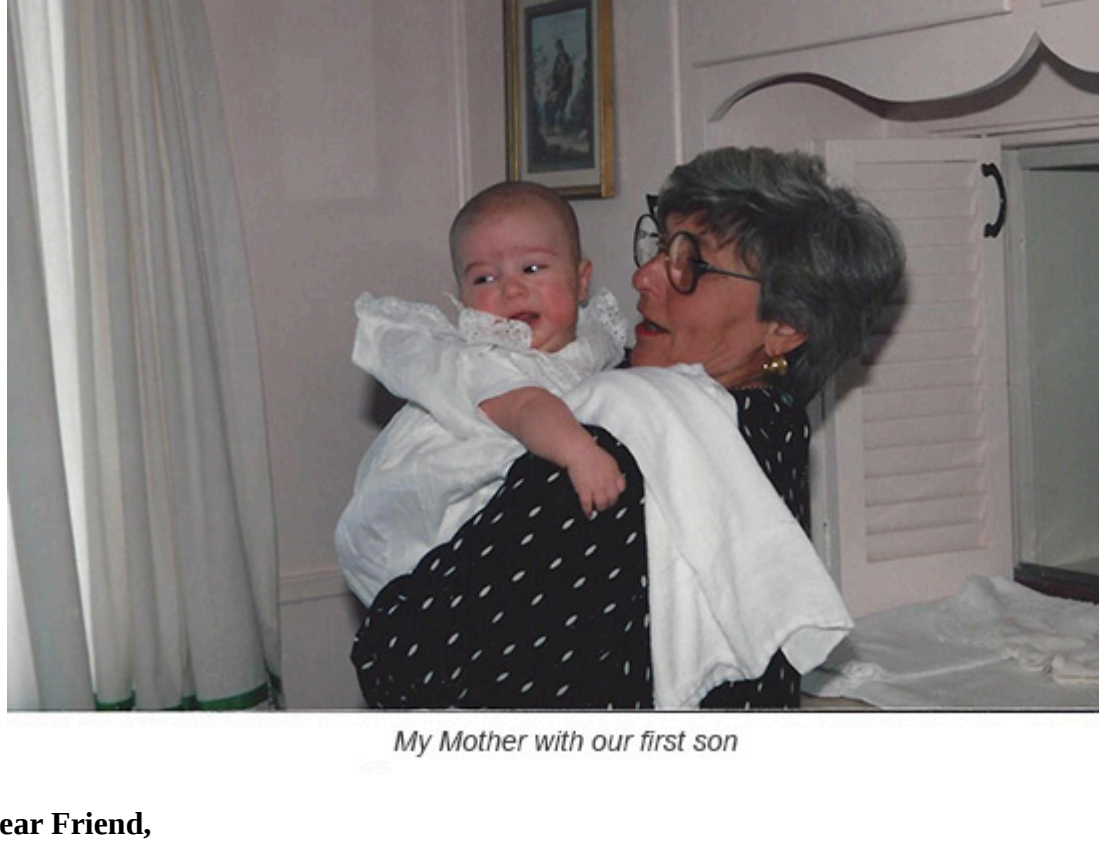
My Mother with our first son